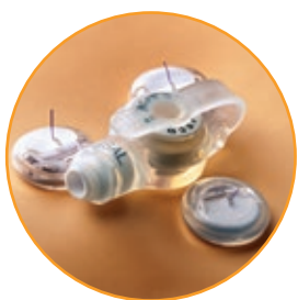
Low-Profile Balloon Button

Allow the placement of a broad range of Enterostomy Feeding Tubes